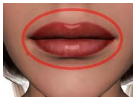
Speech and language therapists